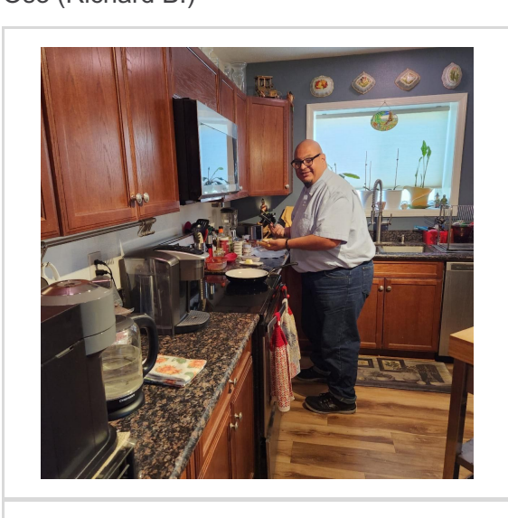
Oso at home cooking