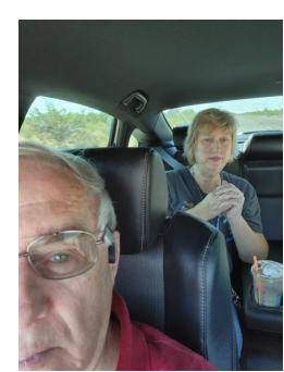
The Lord is Good This can happen in your life