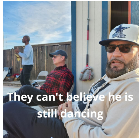
They can't believe he is still dancing