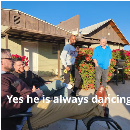
Yes he is always dancing