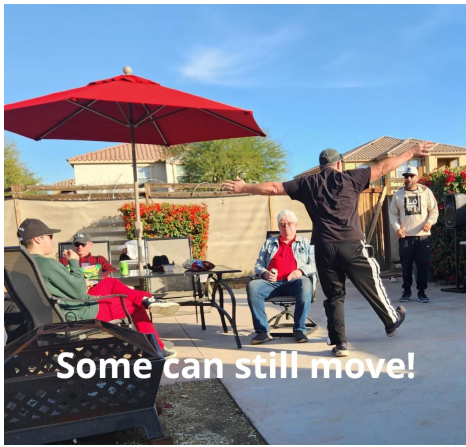
Some can still move!