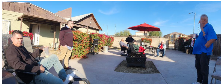
Pre-Party Waiting There Is Room For You