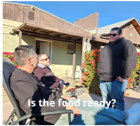
Is the food ready?