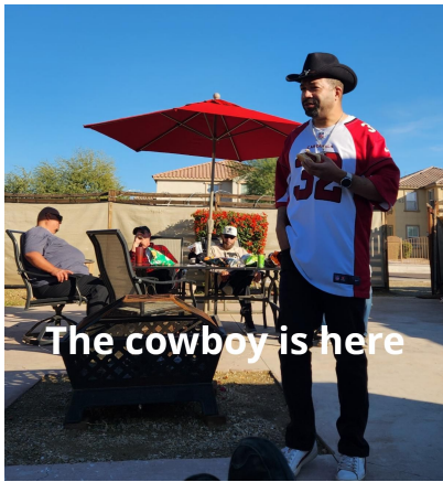
The cowboy is here